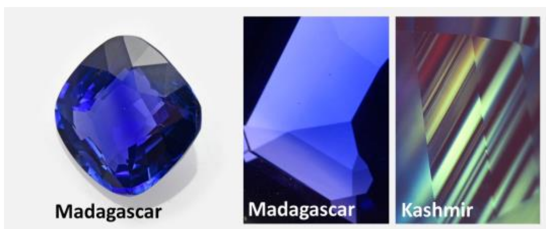
Figure 3: Diffuse purple colour zone (chromium enriched) occasionally seen in new sapphires from Madagascar (left) compared to fine narrow growth layers with red visible fluorescence (due to chromium) in Kashmir sapphire.

Occasionally, the new sapphires from Madagascar show a marked chromium concentration, resulting in larger purplish zones with a diffuse outline within the sapphire. This zoning feature is greatly in contrast with those found in Kashmir sapphires. In fact, Kashmir sapphires may show very thin and well-defined growth layers enriched in chromium, and are only visible when exposed directly to a strong light source, as reddish visible fluorescent layers (see Figure 3). Kashmir sapphires do not, however, show diffuse purplish colour zones under normal light.