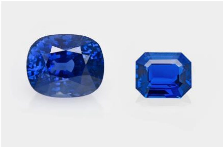
Figure 1: 'Kashmir-like' sapphires of exceptional quality and size (left 30 ct, right 13 ct) from Bemainty near Ambatondrazaka in Madagascar.

In recent weeks, the Swiss Gemmological Institute SSEF has analysed a significant number of sapphires from a new deposit at Bemainty, near the small town of Ambatondrazaka in Madagascar, which were submitted to us by several reliable independent sources. Bemainty/Ambatondrazaka is the site of a new gem-rush in Madagascar, which over the past few months has produced an impressive amount of sapphires, fancy coloured sapphires, and padparadschas of partly exceptional size and quality (Krzemnicki 2017 in SSEF Facette www.ssef.ch/research-publications/facette/ and upcoming Journal of Gemmology , Perkins 2016, Perkins & Pardieu 2016, Pardieu et al. 2017), and it appears to be a new gem source of greater importance than anything we have seen in recent years.