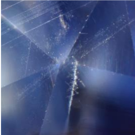
Figure 4: Dust tracks in one of the new 'Kashmir-like' sapphires from Madagascar.

The new 'Kashmir-like' sapphires from Madagascar may show fine dust lines and tracks and flakes (Figure 4), which are to some extent reminiscent of similar structures in Kashmir sapphires. However, we would like to remind readers that similar structures have also been described in 'Kashmir-like' sapphires from Sri Lanka and Andranondambo (SE-Madagascar). Therefore, these features are only of limited use to identify the origin of a sapphire.