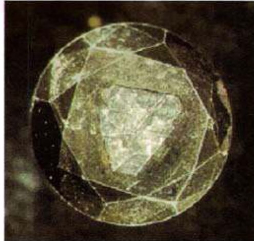
Right: Fig 2: Black diamond with colourless central zone and black rim due to many small black inclusions.