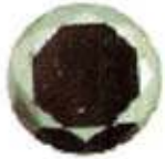
Left: Fig 1: Black diamond.

Based on our results, the stone was identified as a natural diamond with artificial colour, produced by an HT treatment.