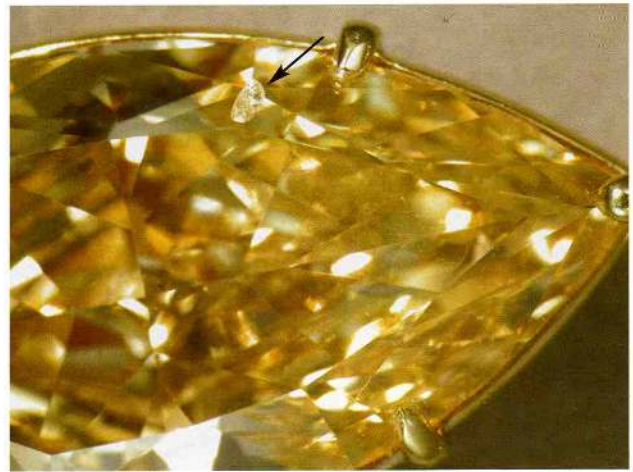
Figure 5. The chip (see arrow) on the crown of this yellow pear-shaped diamond appears to have been created by a misdirected shot from a laser soldering gun. A prong in the setting showed evidence of recent repair by laser soldering. A dark spot at the bottom of the pit was identified as graphite.

Chemical analysis performed during the SEM investigation (using a detector for light elements) showed that only carbon was present in the black inclusion, and a