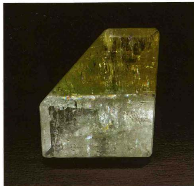
Figure 8. This bicolored beryl (13.68 ct) was cut from material recovered in early 2006 from the Erongo Mountains in Namibia. Gift of Jo-Hannes Brunner; GIA Collection no. 36705.

Mr. Brunner donated several pieces of rough and one cut bicolored beryl to GIA for examination. The cut stone (13.68 ct; again, see figure 8) was examined by one of us (KR) and showed the following properties: color—bicolored light greenish blue and yellowish green, with a sharp demarcation between the two colors; R.I.—1.562–1.569 for the blue portion and 1.577–1.584 for the green portion; birefringence—0.007 (both colors); hydrostatic S.G.—2.68; fluo-