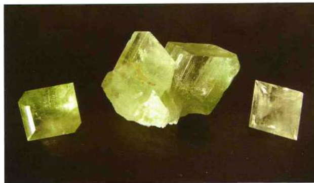
Figure 7. A former quartz mine in northern Peru has produced some fine specimens of augelite; the faceted stones weigh 1.19 ct (left) and 0.94 ct (right).