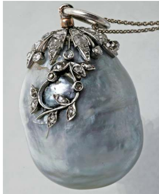
Fig. 4 A large baroque shaped cultured pearl pendant of grey-blue colour. The object is quite light and suggests a large cavity inside.

nacre coating take on the appearance of a light to dark grey stain. We may thus encounter an overlapping of body colours, so grey pearls are not always from Tahitian P. margaritifera oysters (Fig. 4).