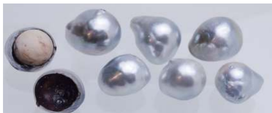
Fig. 3 Larger cultured pearls of grey colour with beads. They have a dark inside lining of decomposed organic matter and a blown up baroque shape.

When oysters are operated on it is not always under aseptic conditions! Occasionally bacterial infections occur and sepsis affects living tissue and toxins develop, even in the pearl pocket. Organic material decomposes and forms black residues and also gases. The necrotic tissue is black and may be situated around the nucleus. The gases may blow up the pearl pocket and a baroque form will take shape. The bead may be loose and difficult to drill. Multiple drill holes witness such formations. Large baroque pearls of grey colour are the result. The necrotic residues shine through the usually thin layer of nacre (Fig. 3). A bad smell is noticed when they are drilled. For Tahiti cultured pearls such a contribution to the general colour is not negative as the pearls are expected to be dark or grey. With white South Sea pearls from P. maxima or white Akoya pearls from P. martensii the grey contribution is less desirable. The necrotic deposits shining through the thin