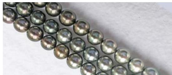
Fig. 2 Three strands of Tahiti Pinctada margaritifera cultured pearls with darker and lighter body colours.