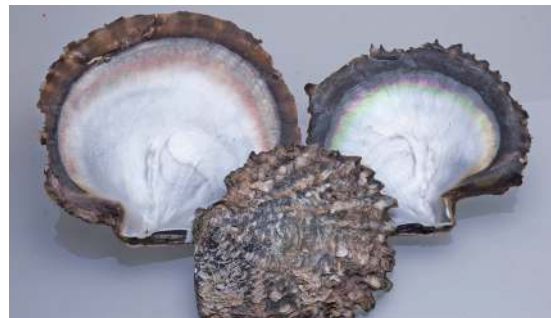
Fig. 1 Pinctada margaritifera shells with a strong dark pigmentation only at the margin. The dark colour fades towards the inside of the shell.

and older people with grey or white hair. The older tissue gradually loses the capacity to form the natural dye. In the same way the mantle tissue of P. margaritifera loses the ability to produce the dark pigment that forms the body colour of dark nacre (Fig. 2). Interference colours are therefore less visible when the dark background is missing. With age the thickness of aragonite tablets also increases slightly, making interference phenomena beyond the visible part of the light spectrum.