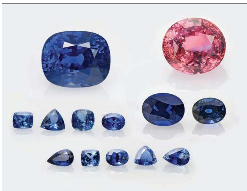
Figure 16: These blue (~1.3–34 ct) and orangey pink (~30 ct) sapphires are representative of some of the stones that were recently studied by SSEF from a new deposit near Ambatondrazaka in Madagascar.

fine particles in zones and bands (Figure 18a), but only occasionally did they have small rutile needles. Some of these sapphires also showed patches and crossed stripes of coarser particles and very fine kinked dust lines (Figure 18b), somehow reminiscent of Kashmir sapphires. We also observed characteristics found in gem-quality sapphires from other metamorphic-related deposits in