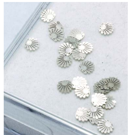
Figure 3: Silver logo labels (3 mm in diameter) for a pearl farm. These can be affixed onto the bead prior to insertion and later be used to trace a beaded cultured pearl back to its farm.

Any such logo marker must be extremely thin, be composed of noble metal (and therefore be resistant to corrosion) and have the same convex shape as the nucleus to ensure that the resulting cultured pearl is also round. However, the production of such round metal labels, generally 3–4 mm wide and 0.05 mm thick, is relatively expensive. Different label production techniques were tested, such as galvanic production, pressing, etching and cutting with a