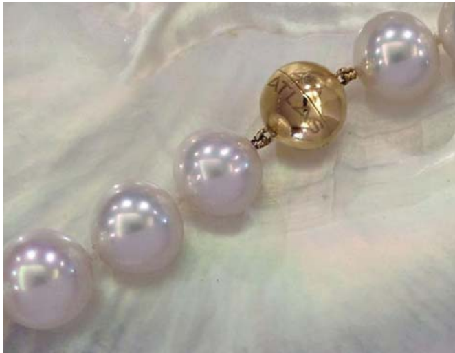
Figure 1: A branded necklace of South Sea cultured pearls (12 mm in diameter) produced by Atlas Pearls in northern Bali and West Papua (Indonesia).