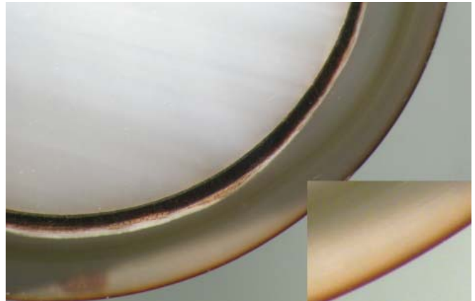
Figure 2: Cross-section of a 'chocolate' beaded cultured pearl. The light-coloured bead (i.e., nucleus) and the darker overgrowth are clearly visible. It is evident in the enlarged image at the bottom right that the brown colour has been artificially added. This demonstrates the porosity of a cultured pearl and its potential for absorbing chemically doped or colour-doped solutions. The colour has penetrated approximately 0.5 mm.

pearl (also called nacre) surface of pearls is made up of aragonite tablets. A pearl's porous structure means that it has a good potential for absorbing chemically doped or colour-doped solutions. A good example of this are dyed cultured pearls (e.g., Figure 2), which can be found in many different colours (Hänni, 2006; Strack, 2006). In a similar way, cultured pearls from selected producers could be marked using a colourless doped solution — that is unique to a pearl producer — after harvest. If chemically doped, these pearls could later be identified in a gemmological laboratory using EDXRF spectroscopy (Hänni, 1981). However, the applicability of this approach is limited given that EDXRF spectroscopy is not in widespread use in the jewellery industry.