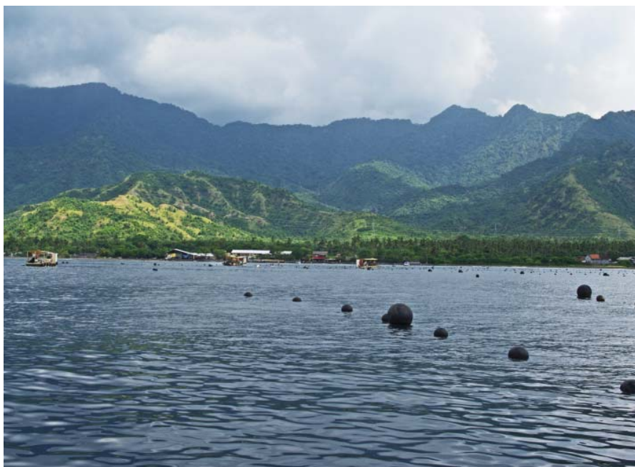
Figure 7: The Atlas Pearl farms that produced the necklace shown in Figure 1 are located in Bali (shown here) and West Papua, Indonesia. Giving consumers access to the origin of their cultured pearls may create additional value for pearl farmers.

Table 1 lists the results for the seven shell samples and three cultured pearls from different locations that were