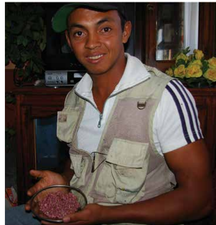
A ruby is not always a ruby. Not all mined minerals are valuable gems, such as in this example with an artisanal mine production of low-grade corundum from Madagascar.

As customers and investors increasingly engage with the gem sector on claims of responsibility and ethics, they will demand transparency and proof of claims and measurable impact (Bates, 2020).