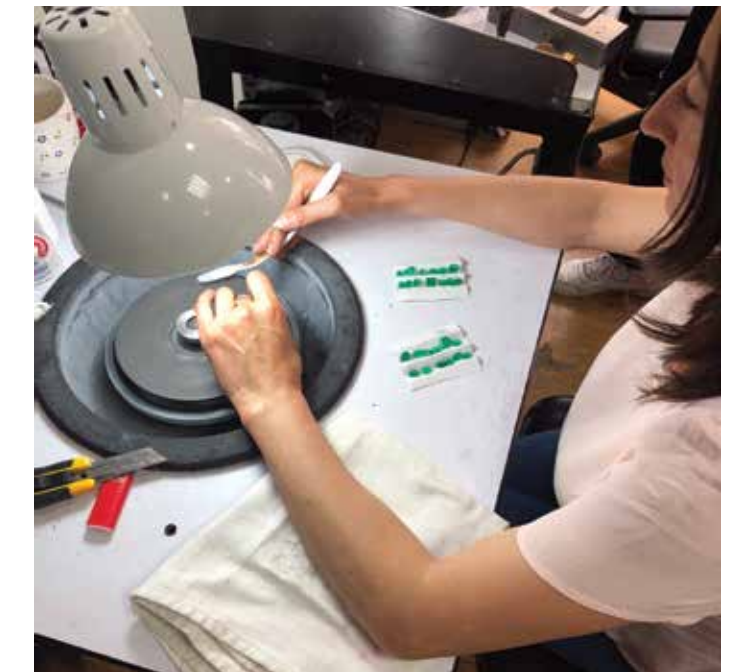
The Colombian gem sector has successfully added value and jobs by supporting downstream activities such as gem cutting in Bogotá.

Ultimately, both traceability and standards seeking to promote responsibility and ethics seek to improve the sector's