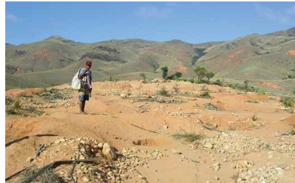
Environmental reclamation of old mining pits is key if the industry is to improve the environmental footprint of gem mining.

If consumers are informed about initiatives that seek to measurably improve the livelihoods of producers and other stakeholders, reducing environmental degradation (Cartier, 2010) and upholding human rights, it is the industry's own success that is improved.