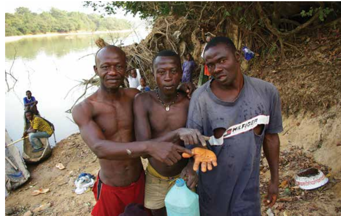
Proud artisanal diamond divers on the shores of the Sewa river in central Sierra Leone in 2007. How have “ethical” considerations in the gem and jewelry (including KPCS) industry contributed to sustainable development in Sierra Leone?