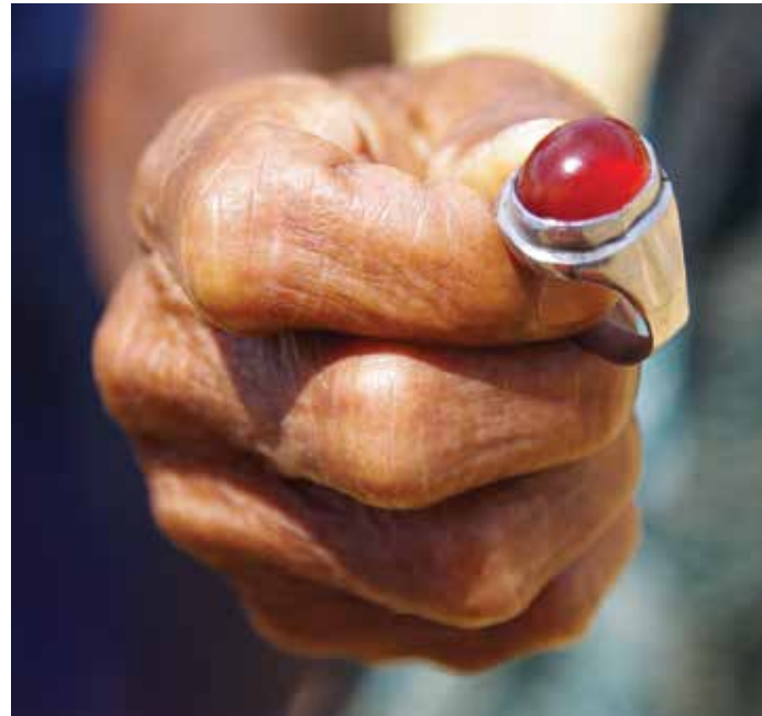
A ruby imitation offered to the author in South Kalimantan, Indonesia. What ethical and sustainability implications does incomplete disclosure have on the industry?

The KPCS sought to stop the inflow of these diamonds into the legitimate diamond supply chain by putting in place a country of export certification program, although there have