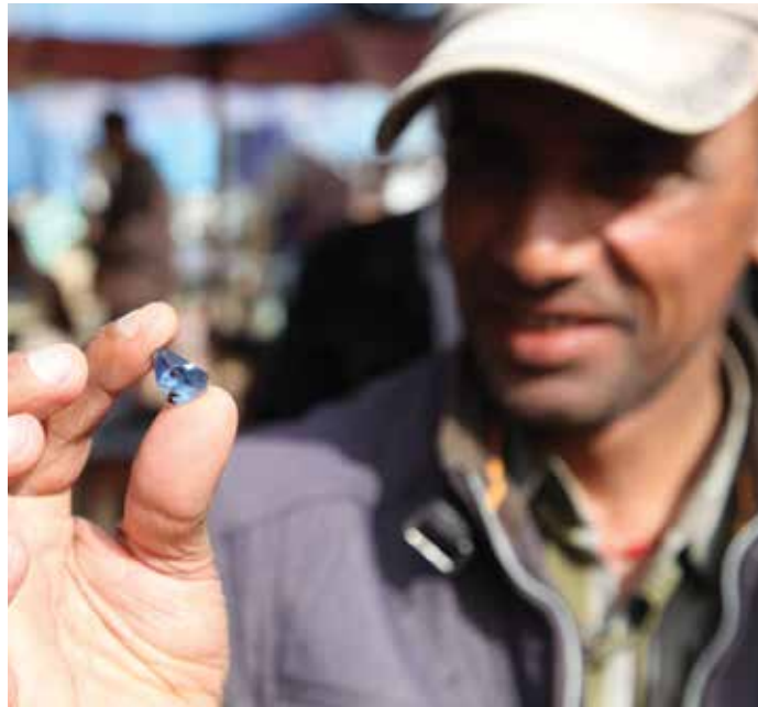
A sapphire from the Mogok Stone Tract in Myanmar (Burma). Every stone has its own story.