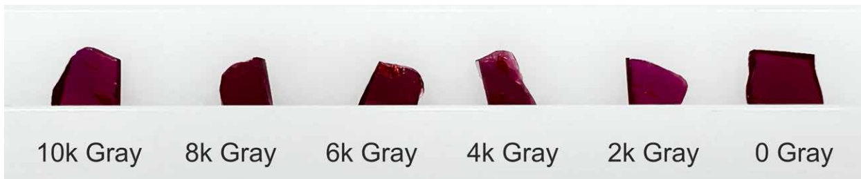
Figure 2: Visual inspection of ruby (six dark red slices, cut from a single stone) after gamma radiation treatment with incremental change in radiation dose.

The study reveals that gamma irradiation has a notable effect on the colour of pink sapphire, causing a shift from pink or purple hues to orange (Figure 1). However, this colour transformation appears to be generally unstable, as most pink sapphires revert to their original colour within a few months. However, in our samples, there was one exception (light pink sapphire Sample #3) which after exposure to gamma irradiation retained its orange hue, albeit with reduced intensity, for more than four months without reverting to its initial color. Even after undergoing a fading test, the orange shade of Sample #3 persists and is deemed stable. Hence, it can be deduced that at least two types of colour centres might be involved in this scenario. One color center might be stable, while the other is unstable. In contrast, the colour of our ruby slices (dark red) did not exhibit any noticeable change after gamma irradiation (Figure 2). These observations on our corundum samples indicate that the effect of gamma irradiation might differ between high Cr and low Cr corundum (Powell 1966).